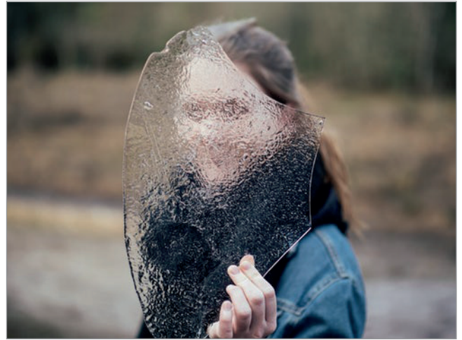
...sometimes it’s that the source wants to be anonymous.

“there is a structural problem and lack of maneuverability. In France a director of an outdoor area can grant an interview or participate in a live program, in Spain that is currently unthinkable.”