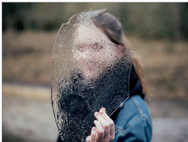
...sometimes it’s that the source wants to be anonymous.

“there is a structural problem and lack of maneuverability. In France a director of an outdoor area can grant an interview or participate in a live program, in Spain that is currently unthinkable.”